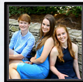
Table Top Sizes (gift prints) range from 7" to 18" and start at $199. These are ideal for family, friends or your office.

WALL PORTRAITS range from 20" to life size and start at $999. Every wall portrait that is ordered is printed on the finest canvas. Add custom framing to your portrait to compliment any home decor.